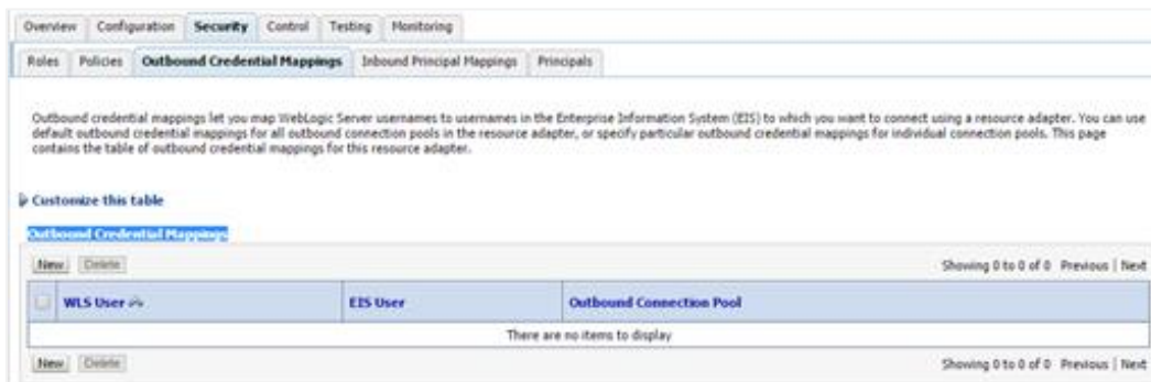
Fig.2 Shows setting for com.ofss.digx.connector.rar

Click Security->Outbound Credential Mapping. This will display Outbound Credential Mappings table.